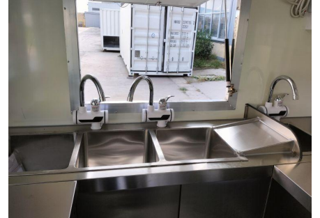
- Sink -