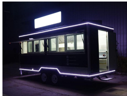
- Light -