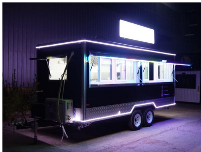
- Light -